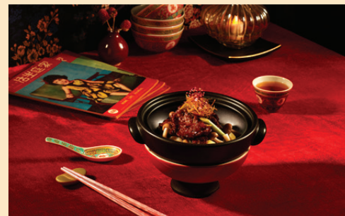
Wok-fried Venison with Ginger, Lemongrass, Black Pepper Sauce, served in a Claypot 香茅子姜葱仔黑椒鹿肉煲