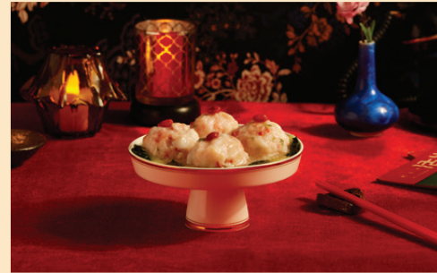
Prawn Paste Ball with Squid and Bird's Nest Stuffing 燕窩釀蝦茸百花球