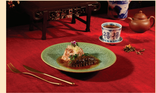
Braised Spiky Sea Cucumber stuffed with Iberico Minced Pork, Leek, accompanied with Five Grain Rice 蔥油燒豚肉釀關東刺參伴五谷米飯