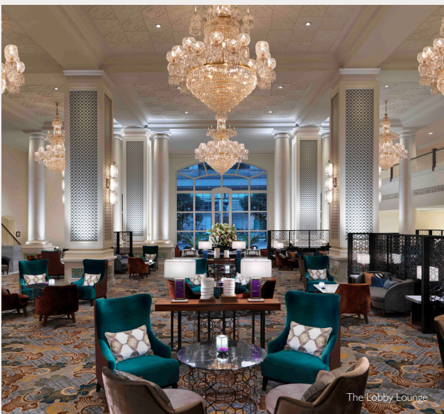
The Lobby Lounge