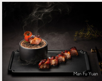
Man Fu Yuan

InterContinental ® Singapore presents a world of gourmet delights including contemporary Cantonese cuisine at Man Fu Yuan; Italian buffet restaurant, LUCE; or an all-day dining experience at The Lobby Lounge.