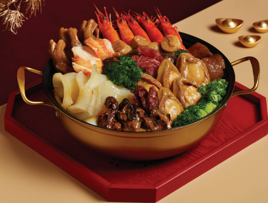
Man Fu Yuan Abundance Treasure Pot, $538 阖家团圆齐欢畅金汤盆菜