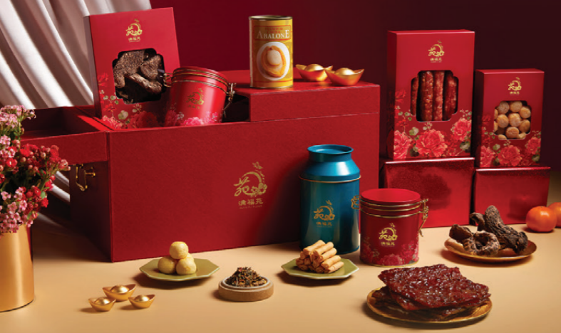
Man Fu Yuan Executive Prosperity Hamper, $388.80 福星高照满福苑礼盒

Indulge business partners and loved ones with a thoughtful hamper to bring out the extravagance of the season. Present the gift of splendour - Man Fu Yuan's Executive Prosperity Hamper (福星高照满福苑礼盒) with a wealth of premium goodies.