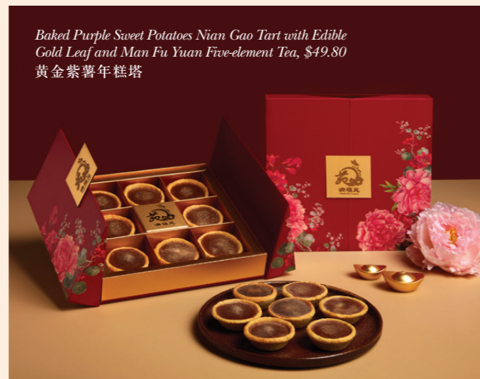
Baked Purple Sweet Potatoes Nian Gao Tart with Edible Gold Leaf and Man Fu Yuan Five-element Tea, $49.80 黄金紫薯年糕塔

Delicately handcrafted by the culinary team at Man Fu Yuan, the crowd favourite Baked Purple Sweet Potatoes Nian Gao Tart with Edible Gold Leaf and Man Fu Yuan Five-element Tea (黄金紫薯年糕塔) features a balanced and smooth sweet potato filling topped with shredded coconut and edible gold leaf, encased within a crisp, buttery tart.