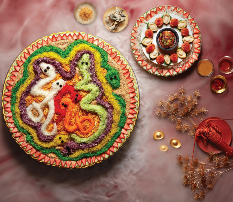
Blazing Snake Fortune Yu Sheng, $988 火焰盘龙鳗—蛇来运转鸿运到捞生

With luxurious ingredients like abalone, rock lobster, ikura, Hokkaido crispy shredded dried scallop, salmon sashimi, and crispy fish skin, this visually stunning Yu Sheng, drizzled with golden Wafu, roasted sesame dressing, and fragrant shallot oil, embodies an auspicious start to the new year.