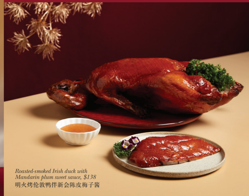
Roasted-smoked Irish duck with Mandarin plum sweet sauce, $138 明火烤伦敦鸭伴新会陈皮梅子酱