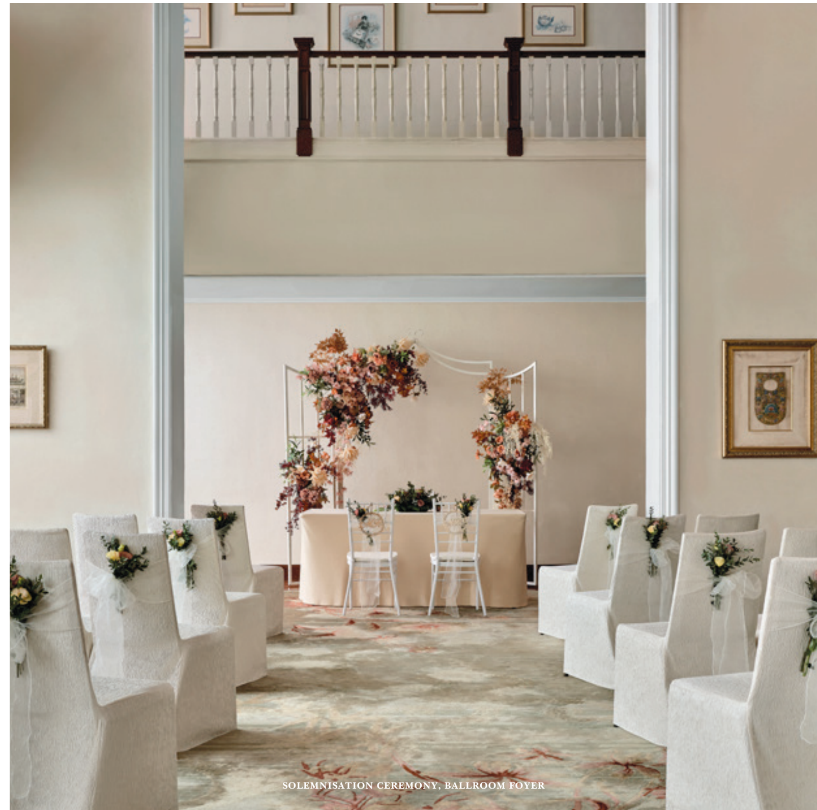
SOLEMNISATION CEREMONY, BALLROOM FOYER

Walk down the aisle in the majestic charm of our colonial-style foyer, as you recite your vows in the presence of your most cherished loved ones.