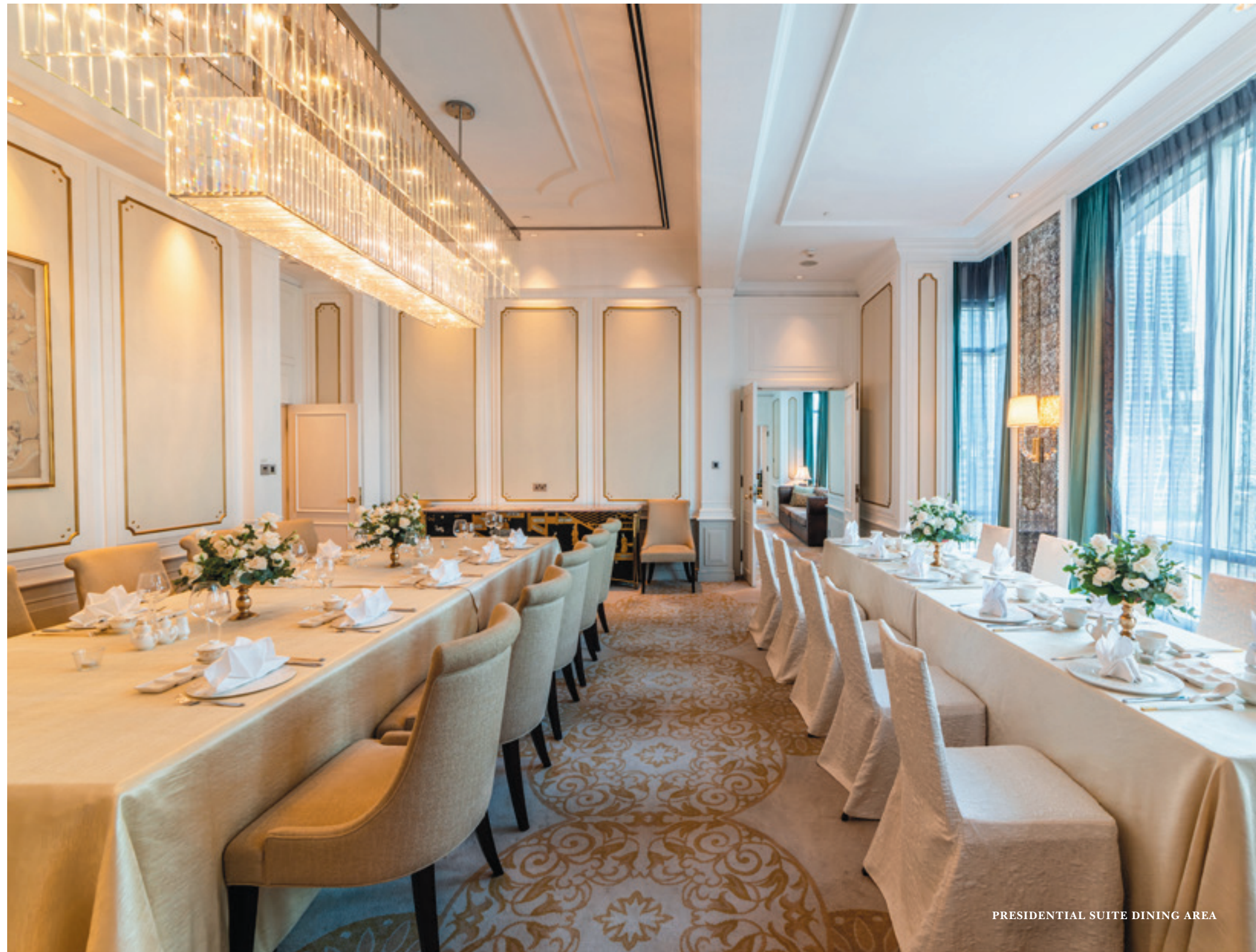
PRESIDENTIAL SUITE DINING AREA

The luxurious confines of our Presidential Suite makes for the perfect venue for an exquisite and intimate wedding celebration.